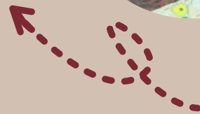
Different activities at the Daycare

Our Stall at an exhibition organized by Asansol Club received a great response.