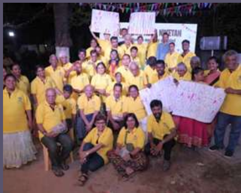
On July 16th, a remarkable carnival journey unfolded - dazzling floats, infectious beats, and boundless laughter. Our hearts hold onto the magic of this unforgettable day, eagerly awaiting the next year's festivities.