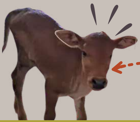
Welcoming a Precious Arrival to Our Farmhouse.