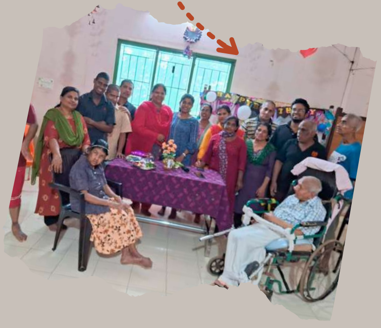
Actor Surya's Fan Team Marks His Birthday at Asha Niketan.