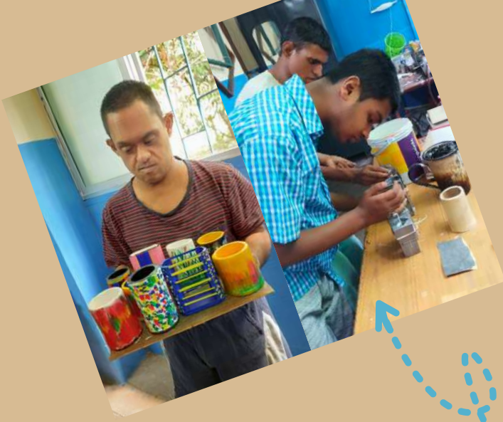
candle are being made at workshop