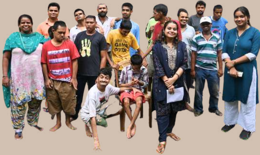
Group photo of the month